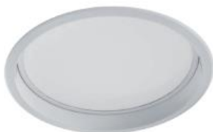
DL 580 LED - mounted in the ceiling