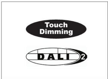
/T+DALI Touch dimming / DALI