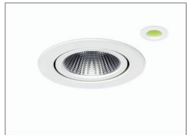
/EM 3h EM conversion c/w remote indicator