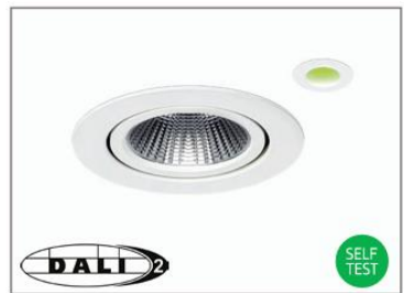
/EMD 3h DALI / ST EM conversion c/w remote indicator