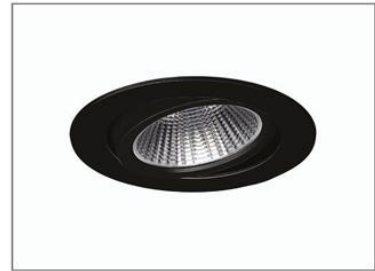
Contact Sales Black body