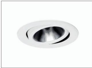
/NB 12° Multi- faceted reflector