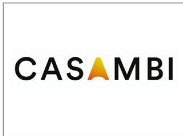
/BTC Casambi Bluetooth wireless network (inc dim)