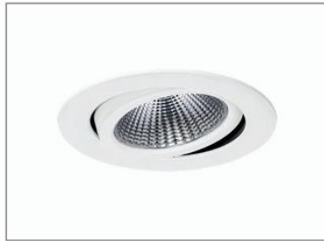
/WB 40° Multi- faceted reflector