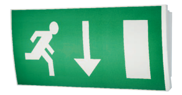
EC Signs Directive format

MEZ/M3/WH Maintained emergency LED luminaire MEZ/M3D/WH Maintained DALI emergency LED luminaire MEZ/230/WH Mains only LED luminaire MEZ/230D/WH DALI Mains LED luminaire