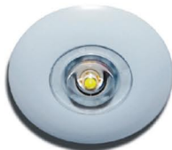
Open area lens