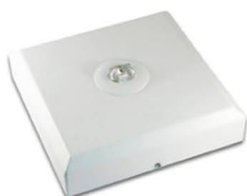
Surface mounted box